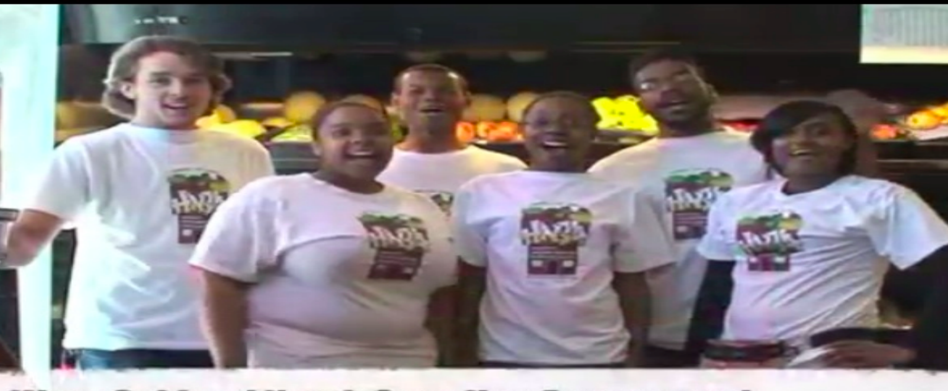
West Oakland Youth Standing Empowered